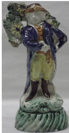
TF015 Soldier.