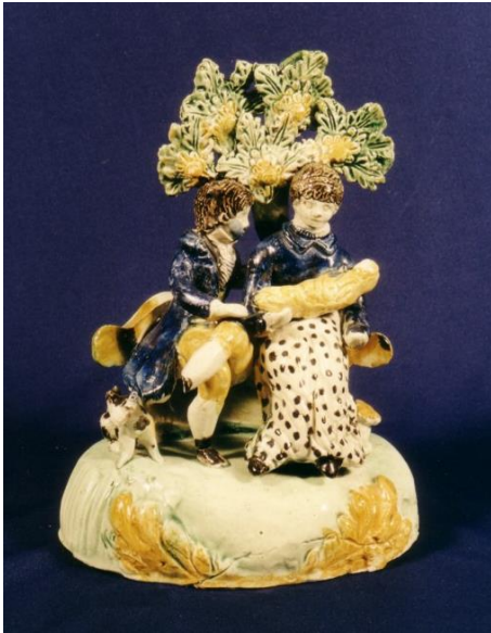
TF009 Young family; Christie's 2003, Deville 2010, Bonham's 2011.