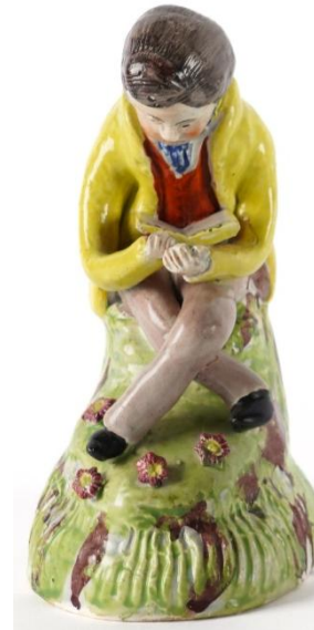
TF034 Seated Boy Reading a Book. Sold Bellman's 2025.