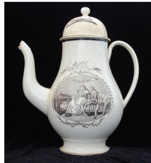
TB5. Coffee pot "Conjugal Fidelity" and oriental birds (14" high). Private collection.