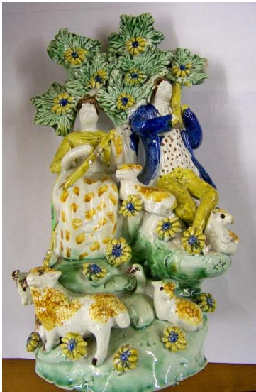
TF031. Musicians.