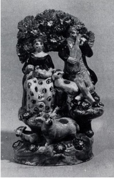
TF006 Rustic figures [10].