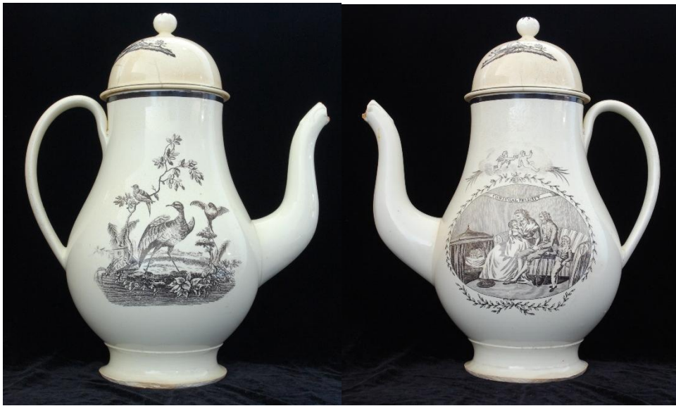
TB5. Coffee pot “Conjugal Felicity” (signed Tittensor) and oriental birds (14” high). Private collection..