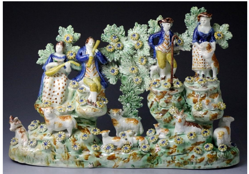
TF033 Bocage Figure Group [18].