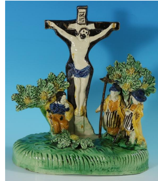
TF016 Crucifixion Group [9,16].