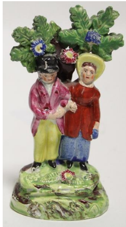
TF032 Dandies [18].