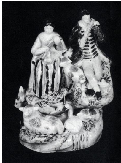
TF007 Songsters, formerly Reed Fit collection.