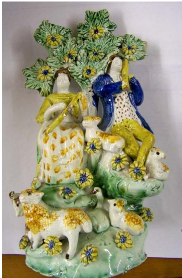
TF031. Musicians.