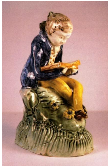
TF011 Boy reading [5,6].