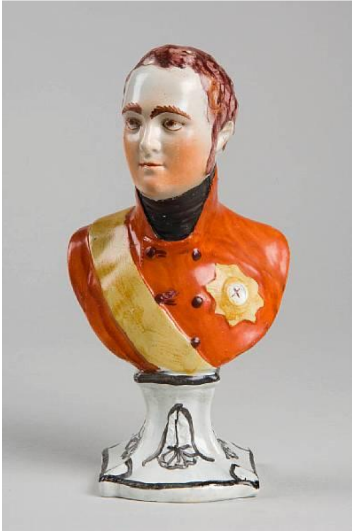
TF027 Pearlware Bust of Alexander I. Two sold at Christies in 1994 (different palettes) and one at Bonham's in 2007.