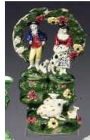
TF003B Shepherd & shepherdess. Sold at Tennants 2003.