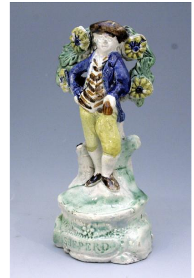
TF004 Shepherd.