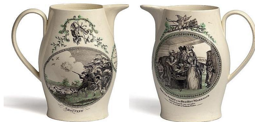
TB6. Cream ware jug “Gretna Green” and “Shooting”. Sold Bourgeault-Horan (NH) 2011.