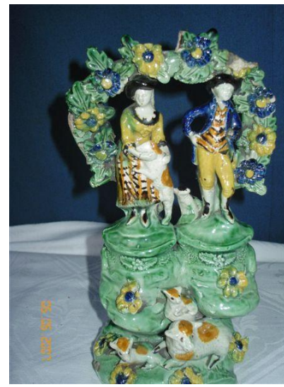
TF003 Shepherd & shepherdess Myrna Schkolne [18].