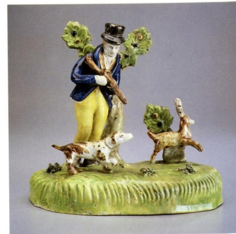
TF020 Deer hunter [6]. www.tittensor.com