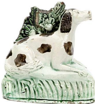
TF022 Dog. Paul Tittensor collection [6]. 13 September 2024