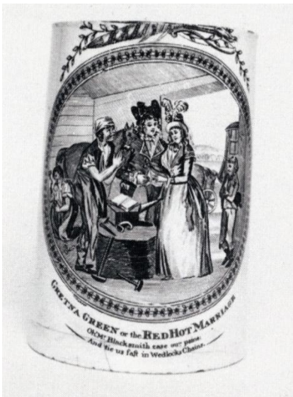
TB1. Cream ware mug “Gretna Green or the Red Hot Marriage” [7,8,13].