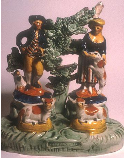
TF001. Pearl ware figure group. Brighton Museum (DA329436).