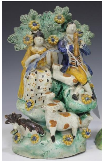
TF008 Staffordshire Figures [14].