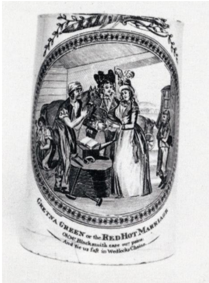
TB1. Cream ware mug "Gretna Green or the Red Hot Marriage" [7,8,13].