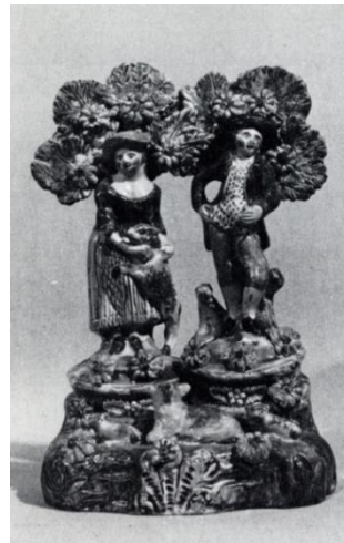
TF005 Boy & Girl [10].