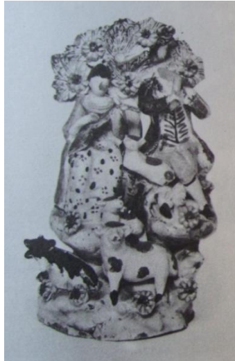
TF008 Staffordshire Figures [14].