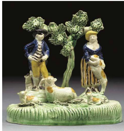
TF002 Shepherd & shepherdess Halfpenny [6]. Same piece sold at Christie's 2003 & Bonham's 2011?