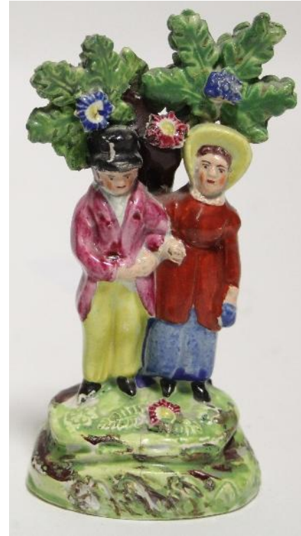
TF032 Dandies [18].