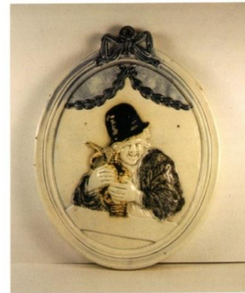
TF019 Jacob Tittensor Toper plaque dated 1789 [1,5].