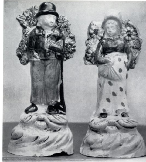
TF017 Sailor & his lass [11].