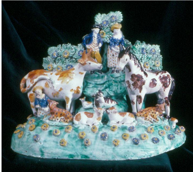
TF026 Farmyard Group.