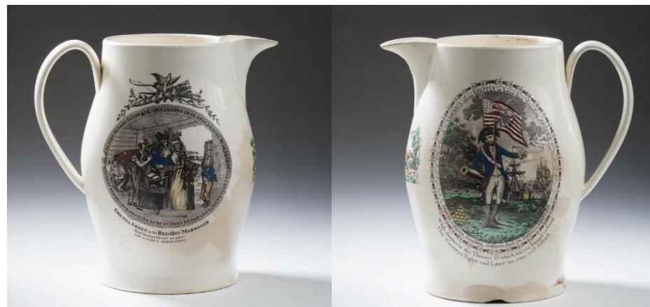
TB4. Cream ware jug “Gretna Green” and “American Militia”. Sold North East Auctions 2013.