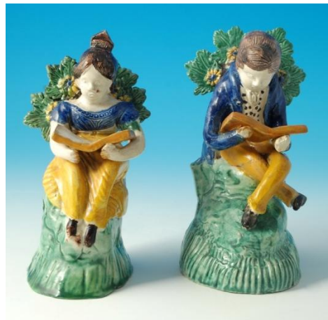
TF013 Figures of Children. Sold Bonham's 2011. Also Roger de Ville 2012.