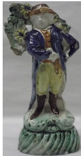
TF015 Soldier. Tyne & Wear Museums D1509. 13 September 2024