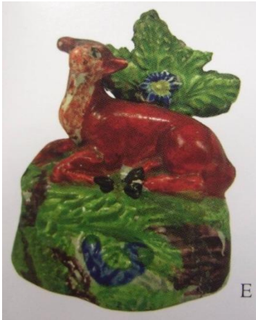
TF021 Deer. Potteries Museum & Art Gallery [19].