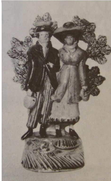
TF024C Rare Staffordshire earthenware figure of the 1815-23 period with typical bocages at the back 7½in high. Marked TITTENSOR [1, 14].