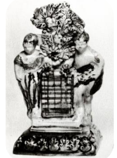
TF028 Impressed mark Tittensor earthenware figure [9]. www.tittensor.com