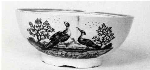
TB3. Staffordshire print bowl, centre with Gretna Green or The Red Hot Marriage signed "Tittensor". Exterior with black prints of exotic birds, farm workers / girl in landscape [7].