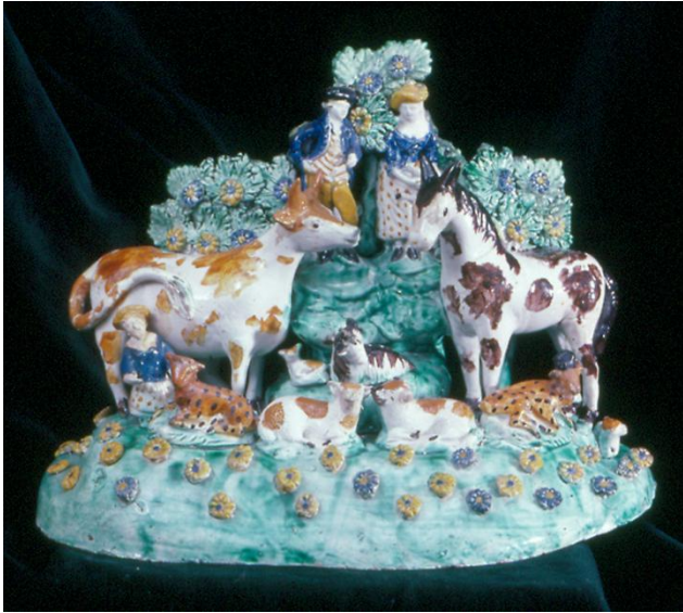
TF026 Farmyard Group.