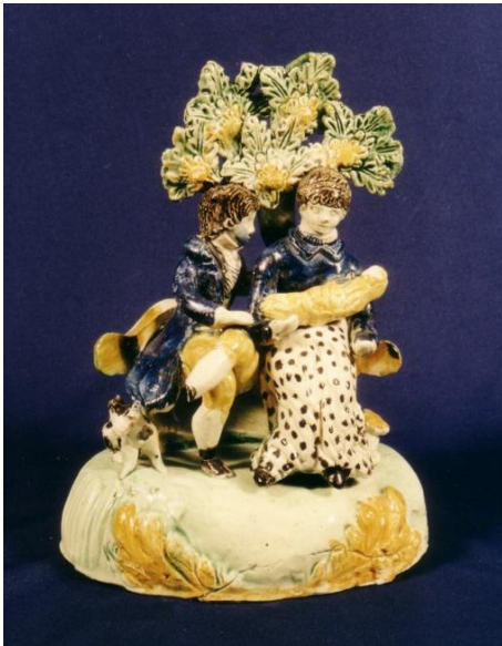
TF009 Young family; Christie's 2003, Deville 2010, Bonham's 2011.