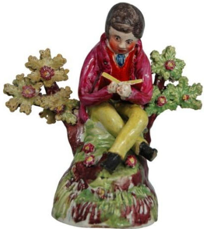
TF012 Figure of Boy [6]. Sold Bonham's 2011. Photo [18].