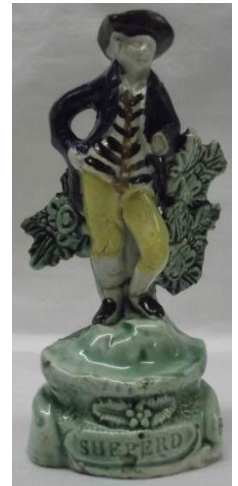
TF004B Shepherd. Tyne & Wear Museums D1508.