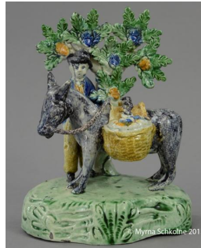
TF030. Man with Donkey. Private collection.