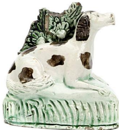
TF022 Dog. Paul Tittensor collection [6]. 12 November 2025