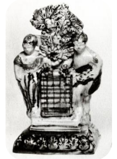
TF028 Impressed mark Tittensor earthenware figure [9]. www.tittensor.com