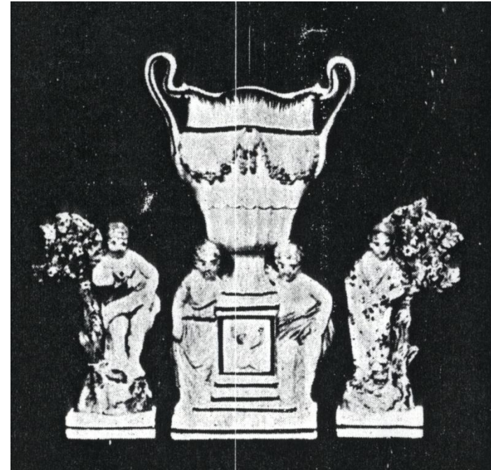
TF025 Vase supported by boy and girl (the pair on either side are unmarked) [1,5].