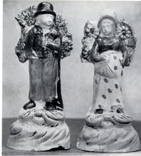
TF017 Sailor & his lass [11].