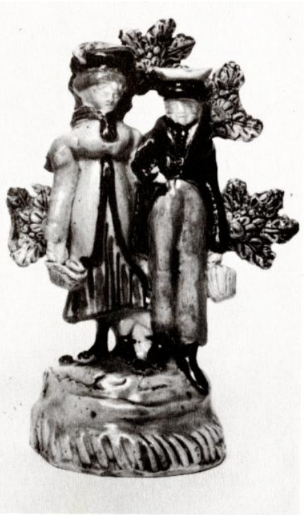
TF024B Dandies [1, 9].