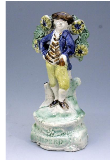
TF004 Shepherd.