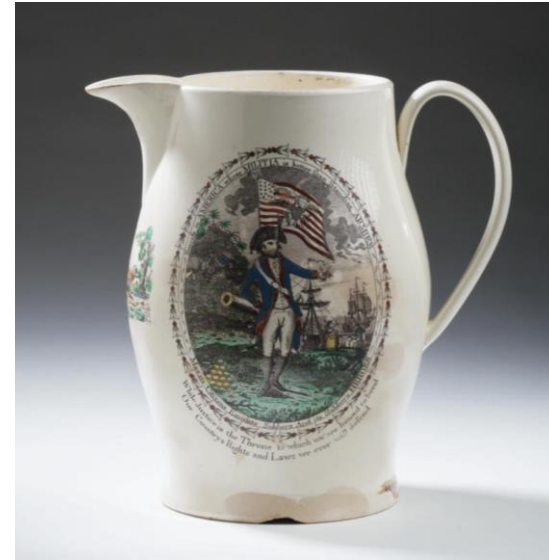
TB4. Cream ware jug "Gretna Green" and "American Militia". Sold North East Auctions 2013.