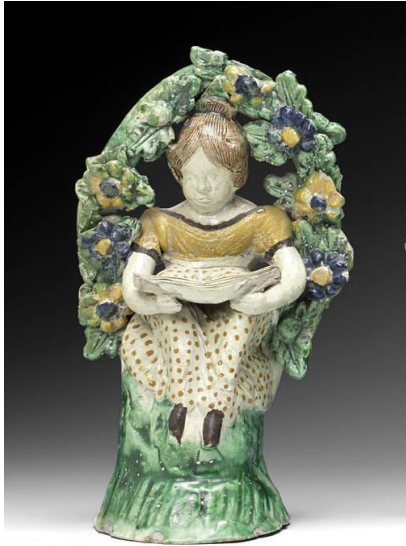
TF010 Arbour figure of girl [6]. Sold Bonham's 2011.