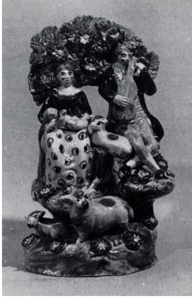
TF006 Rustic figures [10].