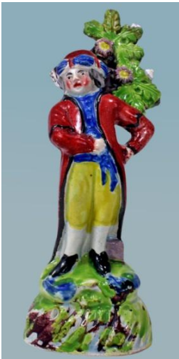
Version 1.7 TF029 Turk [18].